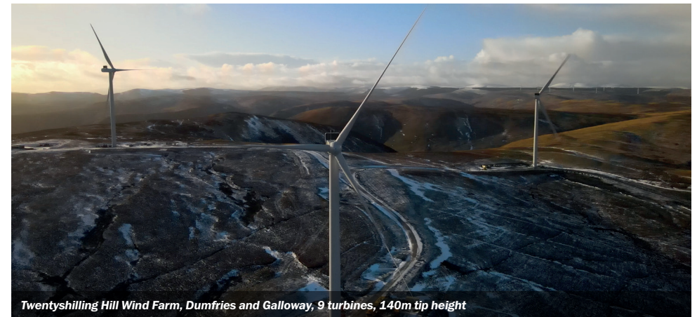
Twentyshilling Hill Wind Farm, Dumfries and Galloway, 9 turbines, 140m tip height

In 2021, we announced our interest in developing a wind farm 11km southwest of Drumnadrochit. Last summer, we exhibited the project at its early stages. Since then we have refined the design and now invite you to view our plans before they are submitted to the Scottish Government later this year.