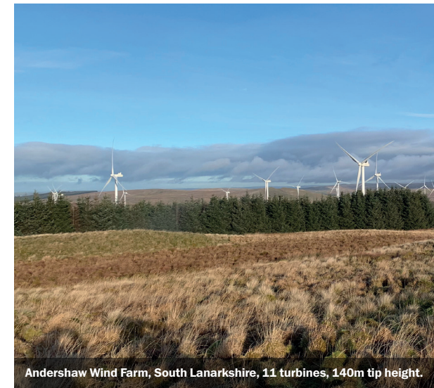
Andershaw Wind Farm, South Lanarkshire, 11 turbines, 140m tip height.

Our first exhibition was held in May and June 2021 to introduce ourselves and the Knockcronal Wind Farm proposal. Since then we have refined the design. We invite you to review our plans, online or in person, before we submit them to the Scottish Government later this year.