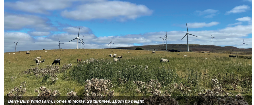
Berry Burn Wind Farm, Forres in Moray. 29 turbines, 100m tip height

We would like to introduce ourselves and our proposal for Carn Fearna Wind Farm.