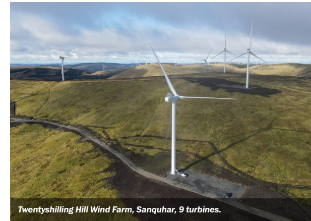
Twentyshilling Hill Wind Farm, Sanquhar, 9 turbines.

We would like to introduce ourselves and our proposal for Appin Wind Farm.