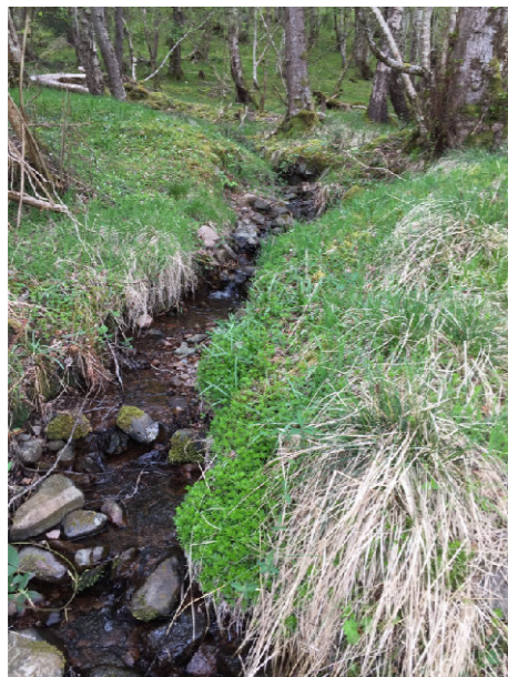
PHOTO 20 - ALLT A'CHRUINEACHD