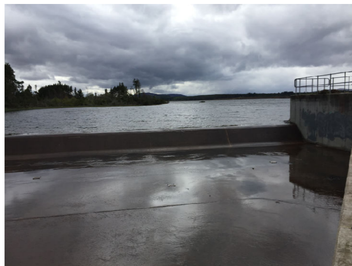
PHOTO 23 - LOCH ASHIE OUTFLOW