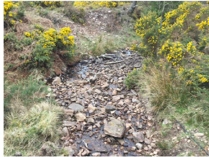
PHOTO 10 - TRIBUTARY TO ALLT A MHINISTEIR