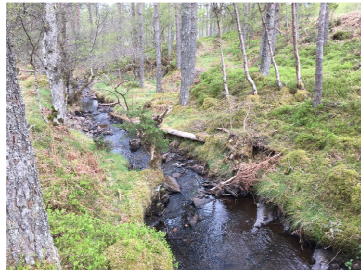
PHOTO 13 - ALLT A MHINISTEIR