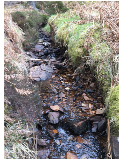
PHOTO 3 - ALLT A MHINISTEIR