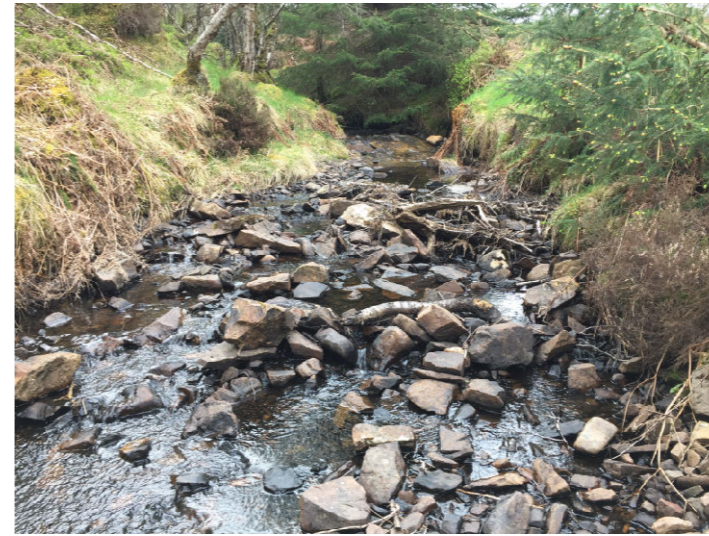
PHOTO 11 - ALLT A MHINISTEIR