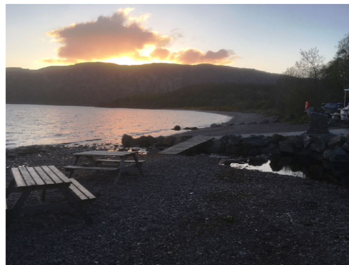
PHOTO 24 - BATHING BEACH AT DORES

TITLE FIGURE 10.3 WALKOVER SURVEY PHOTOS