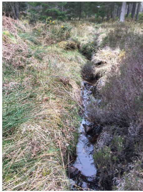
PHOTO 1 - ALLT A MHINISTEIR

PROJECT RED JOHN PUMPED STORAGE HYDRO CLIENT ILI (Highlands PSH) Ltd. KEY