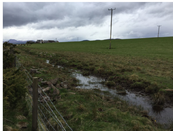
PHOTO 16 - STREAM - FARMLAND

TITLE FIGURE 10.3 WALKOVER SURVEY PHOTOS