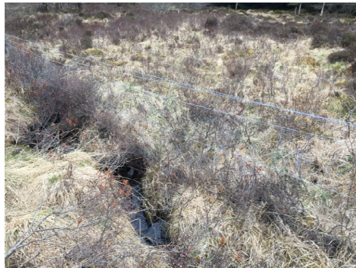
PHOTO 21 - BIG BURN