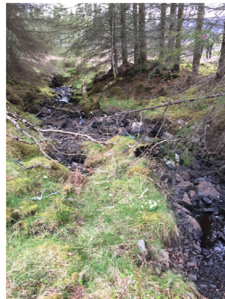
PHOTO 5 - ALLT A MHINISTEIR