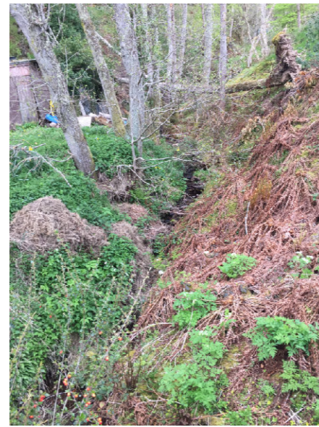
PHOTO 19 - UN-NAMED AT DORES