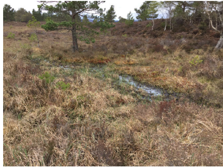
PHOTO 9 - POND INFLOW UPPER

This drawing has been produced for the use of AECOM's client. It may not be used, modified or relied upon by third parties, except as agreed by AECOM or as required by law. AECOM accepts no responsibility, and denies any liability whatsoever, to any party that uses or relies upon this drawing without AECOM's express written consent. All dimensions are indicative and in metres unless otherwise noted. Do not scale this document.