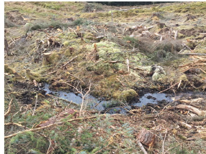
PHOTO 14 - UN-NAMED BURN - FELLED AREA