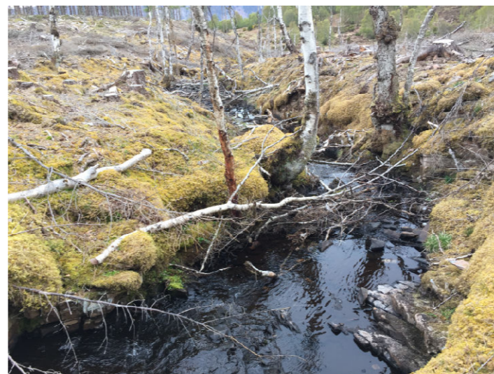
PHOTO 8 - POND INFLOW

This drawing has been produced for the use of AECOM's client. It may not be used, modified or relied upon by third parties, except as agreed by AECOM or as required by law. AECOM accepts no responsibility, and denies any liability whatsoever, to any party that uses or relies upon this drawing without AECOM's express written consent. All dimensions are indicative and in metres unless otherwise noted. Do not scale this document.