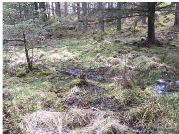
PHOTO 15 - STREAM - WET GROUND