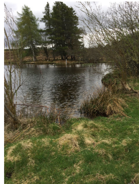
PHOTO 22 - LOCH ASHIE