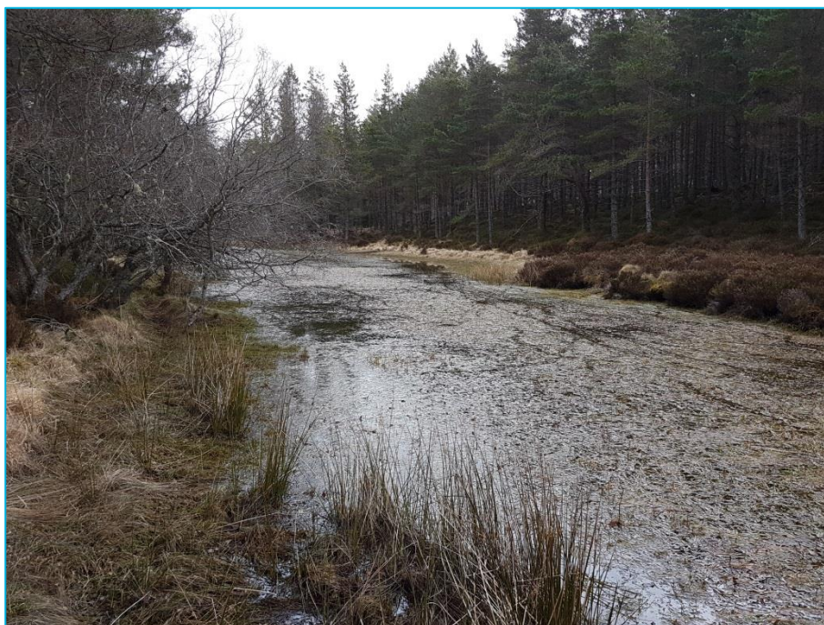
Photo 6.4 View of Durr Wood Pond and Surrounding Woodland Habitat