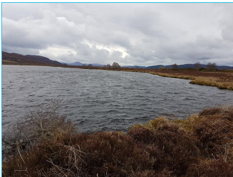
Photo 6.1 View of Loch na Curra and Surrounding Habitat