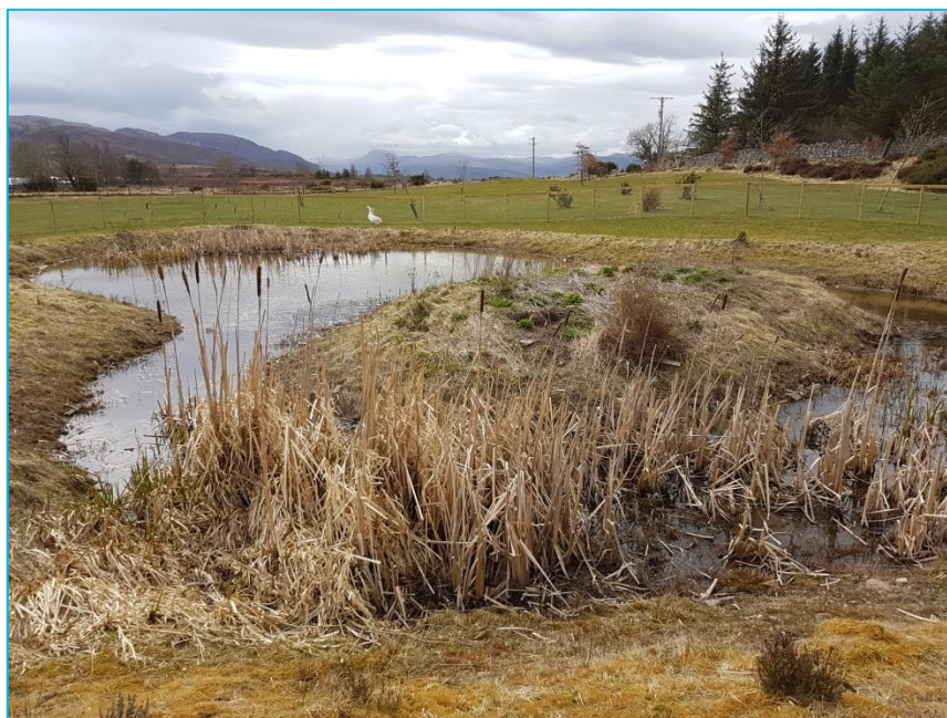
Photo 6.3 View of Ach-na-Sidhe B&B Pond