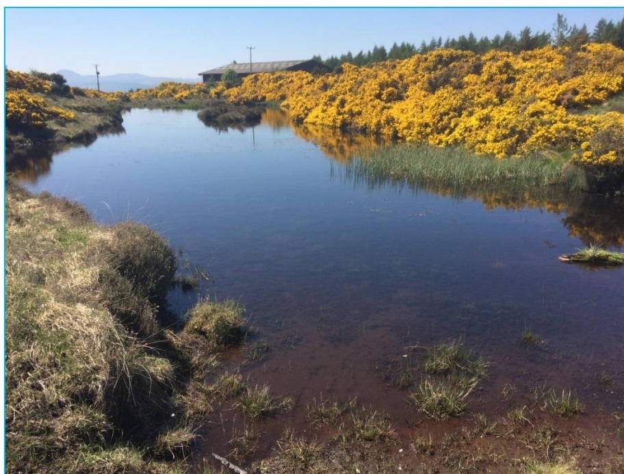
Photo 6.5 View of Park Pond