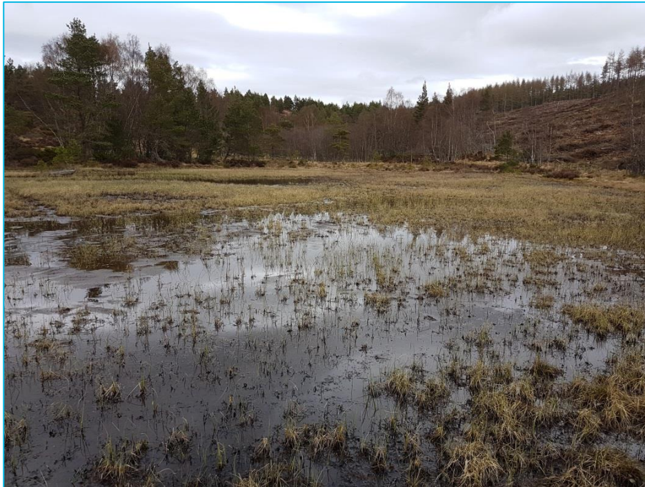
Photo 6.7 Watercourse Flowing out of Glaic na Ceardaich Pond