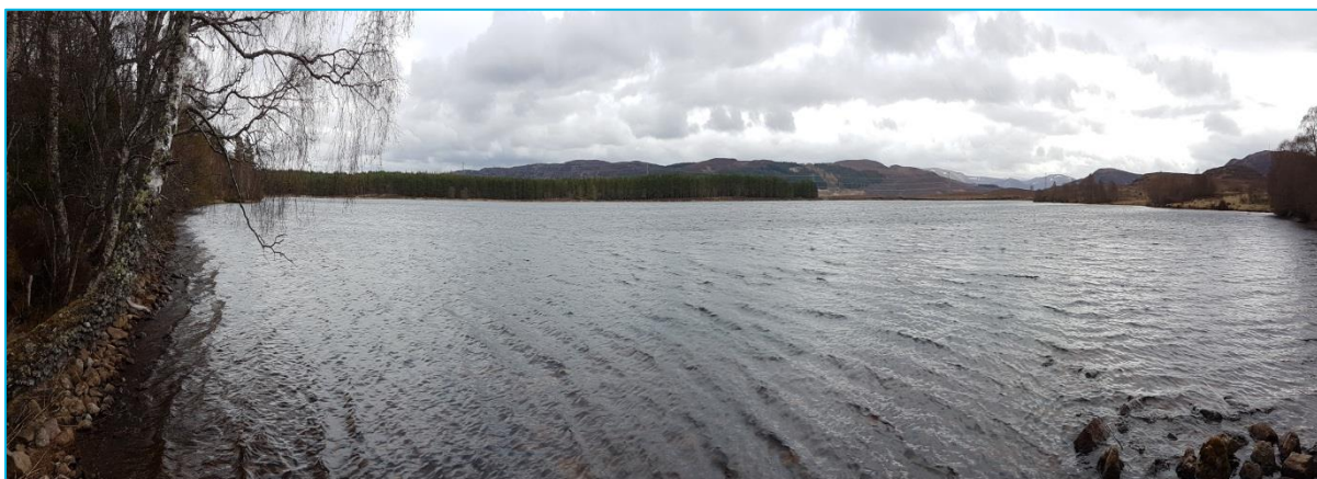
Photo 6.2 View of Lochan an Eoin Ruadha