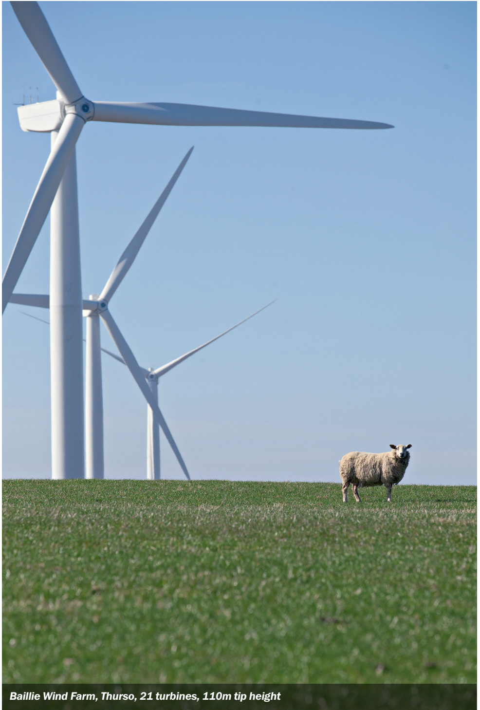
Baillie Wind Farm, Thurso, 21 turbines, 110m tip height