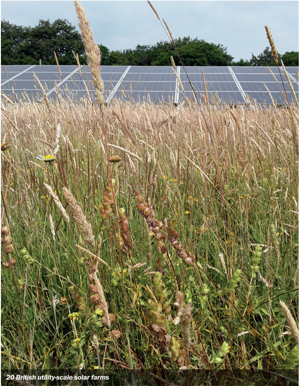
20 British utility-scale solar farms