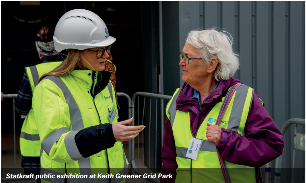
Statkraft public exhibition at Keith Greener Grid Park

We are committed to engaging with the local community and would like to keep you informed. Contact us with your questions, comments or to subscribe for project updates.