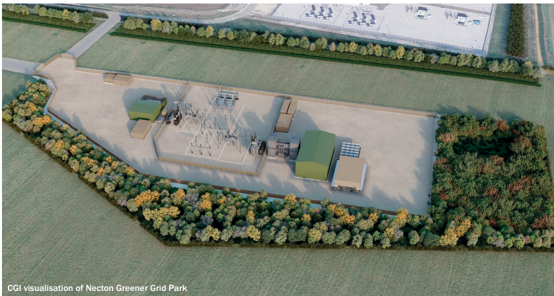
CGI visualisation of Necton Greener Grid Park